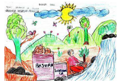
One of the drawings that one the "Let's save the planet" contest

During the year 2009 one of the activities that has been most successful was the drawing contest "Let's save the planet" . We have organized, in the different centers of the project, a lesson about the environment. We then told the kids to express themselves using colors to show how strong their love for nature is.