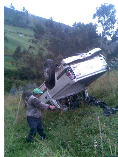
The last image of our car.