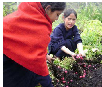
The school vegetable garden project has the objective of recovering native seeds, working only with biological systems and involve teachers and students in order to obtain a more balanced diet.