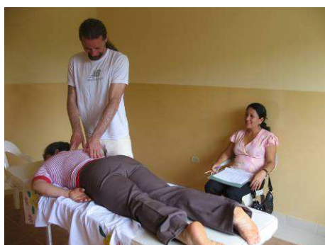
Carlo inaugurates the new cot