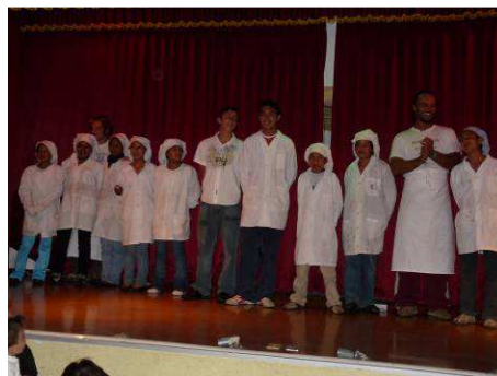
The children attending the cooking class amazed everyone with an excellent gastronomic choice.