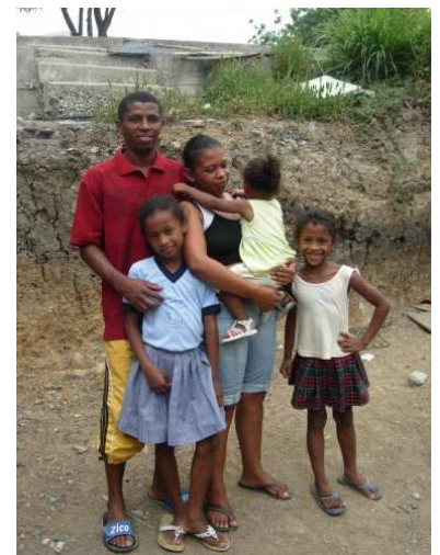
A family from Esmeraldas which is receiving the scholarship