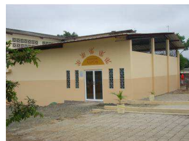
The new physiotherapy class in Chone

We kindly invite any physiotherapist that would like to help us to contact us.