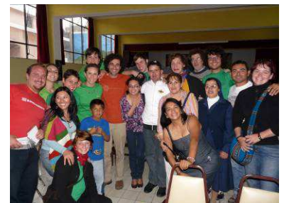
Everybody happy at the end of the event.