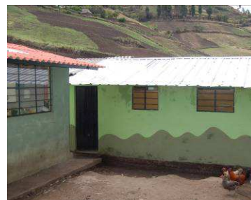
The bathrooms for the Columbe Grande primary school. There are about 100 students that attend this bilingual educative center (Spanish/Kichwa)