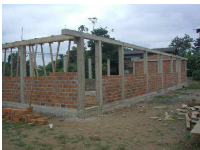
On the left the new Nueva Unión classroom, which extends for 21 meters and it will have several purposes: apart from its normal use for teaching purposes it will also be used as a meeting space for the local villagers. The project was partially funded by the Bolzano Province.

Esperanza is the first indigenous community of the Chimborazo Province where all the families have access to showers with hot water. During November 2009 we purchased 47 gas boilers.