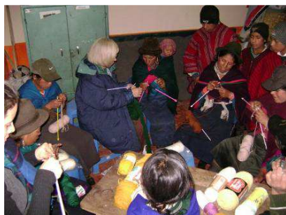
The knitting course has been particularly successful and it stimulated the women of Esperanza to restart doing an activity that was almost forgotten.