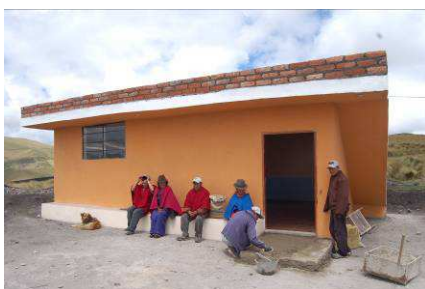
The kitchen of Toropamba (3.850 meters above sea level) which will be used by the residents for communal usage.