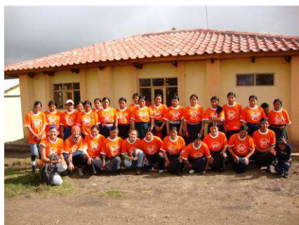
The female category that attended the third "friendship mountain run", which took place on the 1 st of August 2009.