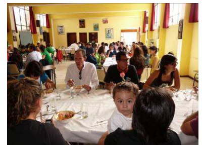
The orphanage living room was used as a restaurant.

The 14 th of November 2009, at the San Vicente de Paul orphanage in Quito, our first fundraising activity in Ecuador was organized; this consisted in a lunch to which about 100 people attended which had the chance to know get to know the activities that are carried out by Ayuda Directa in Ecuador.