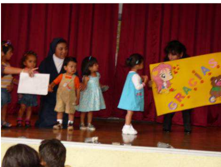
The youngest kids of the orphanage presented themselves to the public with a touching fashion show.