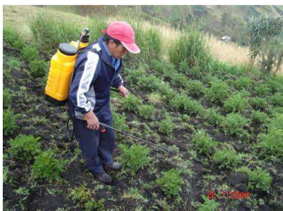
A formative activity about the production and usage of organic fertilizer produced by animal feces was given (BIOL). These activities have been used for the theses of two students of the Polytechnic University of the Army.