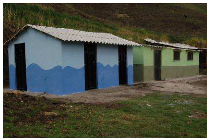
The bathroom (on the left) and the cuyera (on the right), which is the farm of the cuy (guinea pig), built at the school of Huacona Chico.