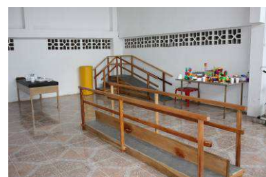
The facilities installed in the class