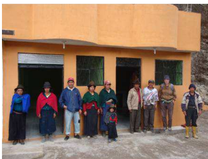
The kitchen and the community shop of Cagrin Buena Fé. The work has begun during July 2009 and it was completed by the end of the year.