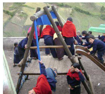
The playground of the school of Esperanza which was installed next to the school during May 2009.